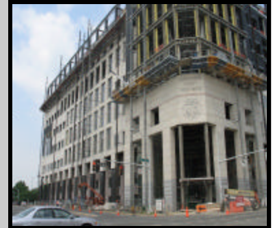
Entrance of new Mecklenburg County Courthouse.

Much thought has been given to the design of the new courthouse. In fact, a survey was conducted among jurors during the planning phase to find out what would make jury service more comfortable. The new design will be more efficient, visitor friendly, and will be a structure the citizens of Mecklenburg County can be proud of for decades to come.